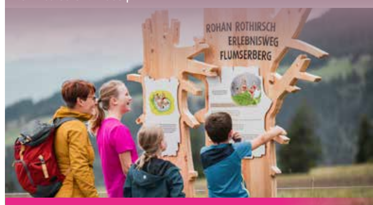
Hiking route: Prodkamm – Spigen – Alp Prod – Prodalp Walking time: approx. 1 hr 15 min

he corresponding collector's card is available free of charge from ergbahnen Flumserberg, mountain inn Prodkamm and the mour