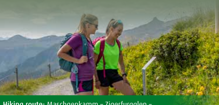
Hiking route: Maschgenkamm – Zigerfurgglen – Maschgenkamm – Maschgenlücke – Prodkamm Walking time: approx. 45 min

The trail Alpenfloraweg features information stations about the plants you will encounter. You can read interesting facts about the diverse flora on Flumserberg. Take a break along the way at one of the various mountain restaurants or stop at a fire pit.